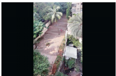
A bird's eye view of the completed project

Starting this weekend, multiple events will unfold at a new landmark in the coastal suburb, where a dump yard has been revamped into an urban square for live performances, exhibitions and workshops